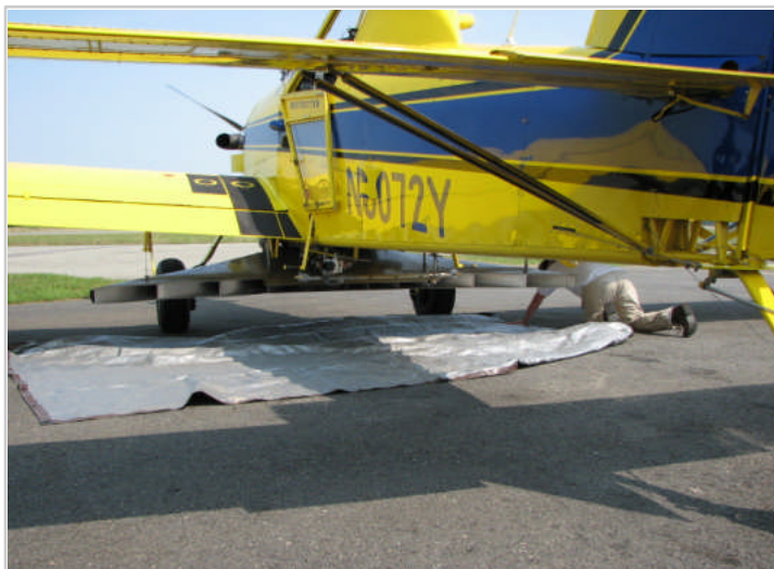
Randy Buchanan makes a final check before removing the tarp under the plane. With the aluminum diverter